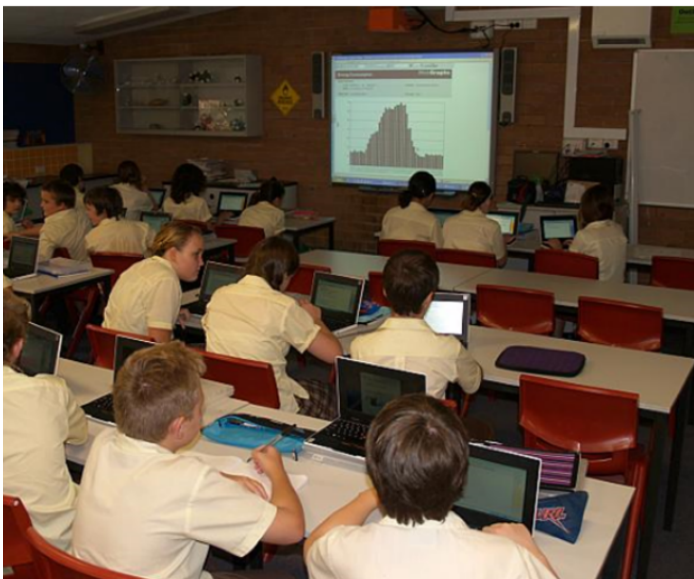
The very first Year 7 Technology Class in 2011

You will also need to design and create a piece of work to showcase your technology skills. Find more information inside this brochure.